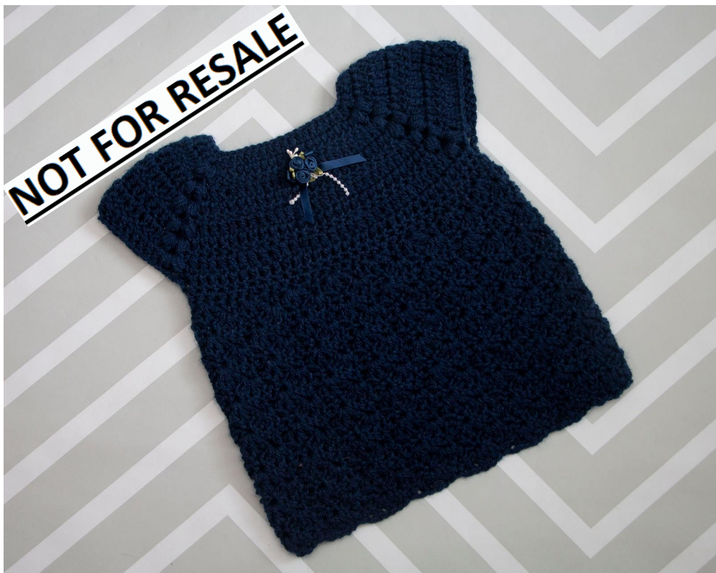
CY1340 Cygnet Pure Baby Anti Pilling DK Puff Stitch Newborn Dress