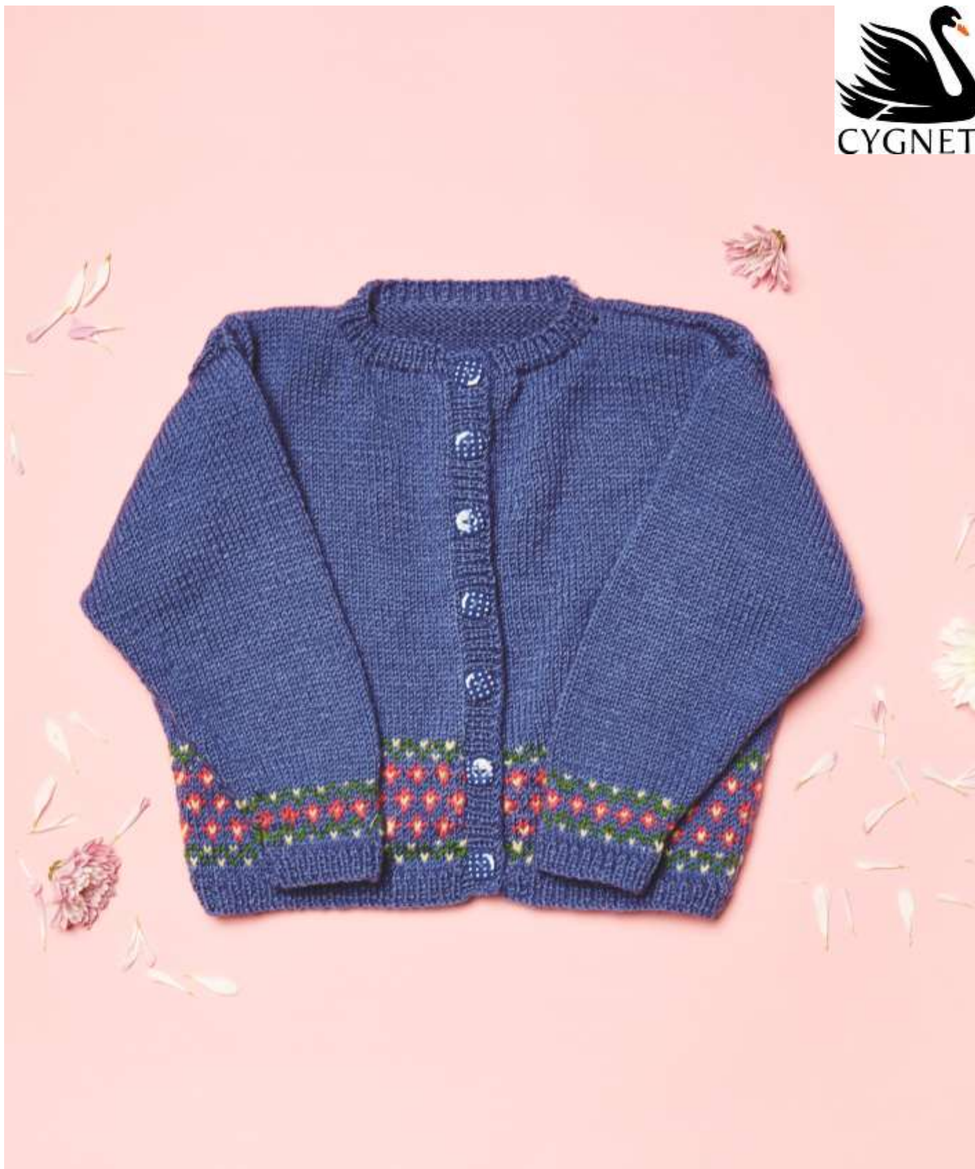
CY1062 GROUSEMOOR DK CORNFLOWER CARDIGAN SIZES 1-5 YEARS