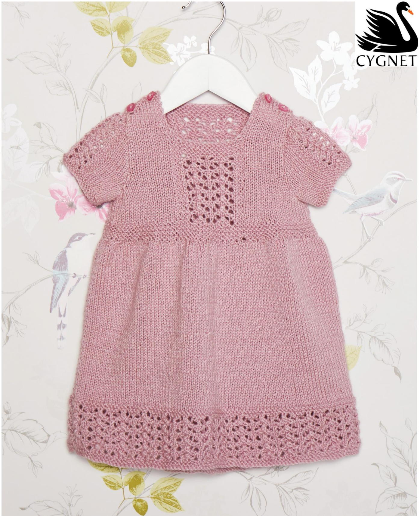
CY1056 GROUSEMOOR DK MABEL DRESS SIZE 6-12/12-18/18/-24 MONTHS